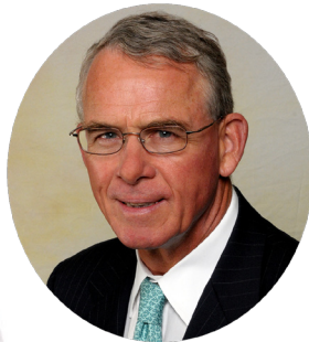
Francis Rooney U.S. Congressman Dist. 19