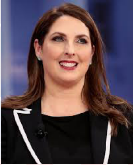
Ronna Romney McDaniel Chair of the RNC

Ronna Romney McDaniel is the current Chair of the Republican National Committee (RNC) and former Chair of the Michigan Republican Party. McDaniel is the granddaughter of two-term Michigan Governor and Nixon administration cabinet member George W. Romney and niece of former Massachusetts Governor Mitt Romney. McDaniel worked for SRCP Media as a production manager. She also worked for the production company Mills James as a business manager and as a manager at the staffing firm Ajilon, McDaniel worked in Michigan for her uncle Mitt Romney's 2012 campaign for President of the United States. She was elected Michigan's representative to the Republican National Committee (RNC) in 2014. In 2015, McDaniel ran for chairwoman of the Michigan Republican Party, receiving support from both the party establishment and Tea Party activists. During the 2016 U.S. presidential election, McDaniel served as a delegate to the 2016 Republican National Convention for Donald Trump. On December 14, 2016, McDaniel was chosen by then president-elect Trump as his recommendation to replace Priebus. She served as deputy chair before her formal election. She was officially elected as RNC chair on January 19, 2017, becoming the second woman to hold the post in RNC history, after Mary Louise Smith.